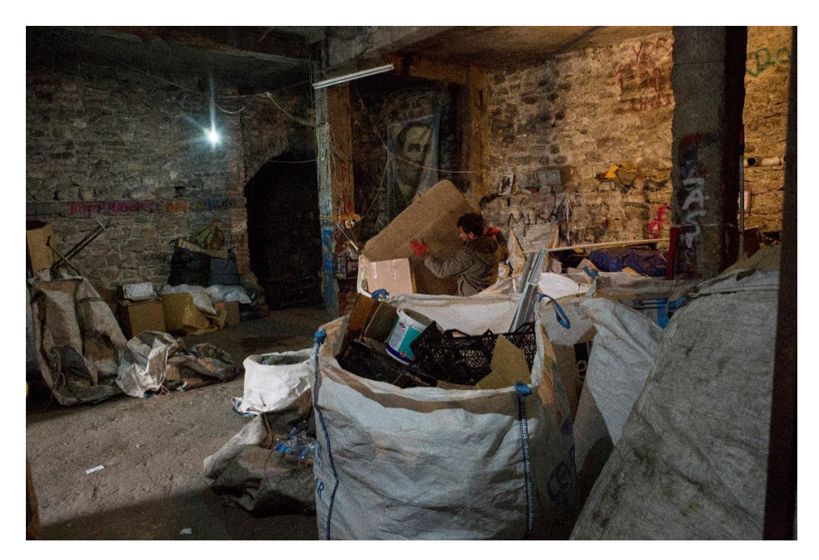
Many Afghan asylum-seekers support themselves in Istanbul by selling recyclable materials they collect from garbage bins, which is later weighed and sorted in depots such as this operation.

Children needing to work to meet the basic needs of their families is a widespread problem, despite this being contrary to Turkey's domestic and international legal obligations. 131 UN agencies report that among Syrian refugees in the country, "child labour is a common phenomenon." <sup>132</sup> In a 2015 survey of over 700 Syrian refugees in Istanbul, the most common reasons for children's non-enrolment in school were that the children needed to work to support the family (26.6%) and that the family could not afford the school fees (20.3%). <sup>133</sup> A Syrian mother of three boys, living in Gaziantep, told Amnesty International that the shrapnel injuries her husband sustained in Syria prevent him from working, and that the entire family of seven survives on the 5-10 Turkish Lira per day (about 1.75 to 3.50 USD) that her nine-year old son earns working at a grocery store. 134 An Iraqi man from Dohuk, living in Istanbul, said that his three children - a daughter aged 18 and two sons aged 17 and 16 - cannot attend school but must work instead. He said: "They must work; otherwise we cannot survive." The 18-year old daughter told Amnesty International that she and her brothers work in a textile factory five days a week, from 8 a.m. until 7:30 p.m., and each make 250 Turkish Lira (about 88 USD) per week. The father said that he was unable to find a job that did not require very long hours, which he is unable to do because he says he is old and tires easily. 135