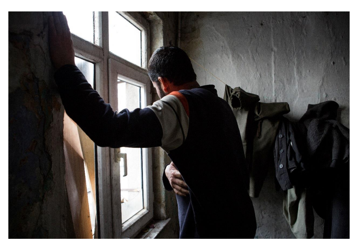
An Afghan asylum-seeker looking out from his flat in Istanbul.

EU member states should be looking at activating such a scheme, in meaningful numbers, without delay.