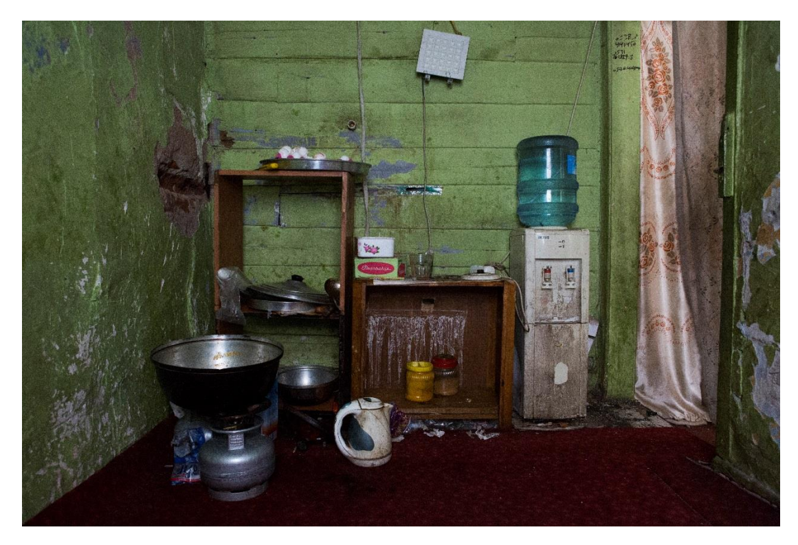
The kitchen for 15 Afghan and Pakistani asylum-seekers living in Istanbul.

living in one small and partly underground room; two single beds, a table, and a refrigerator occupied virtually the entire space.<sup>96</sup>