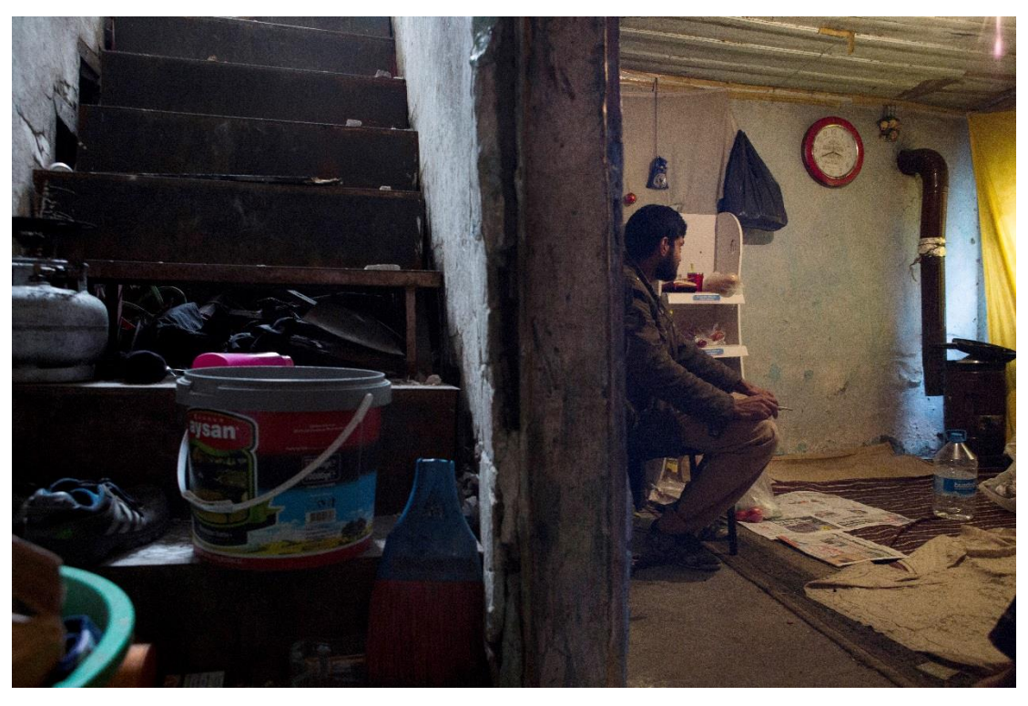
An Afghan asylum-seeker living in Istanbul. Afghans have no realistic prospect of either being integrated in Turkey or resettled to another country.

This chapter discusses the second requirement for the return of asylum-seekers and refugees to Turkey under the EU-Turkey Deal, namely that people are able to access what are known as "durable solutions." UNHCR has identified three possible ways in which this obligation can be met: repatriation (when safe to do so) to countries of origin, integration in host countries, and resettlement to third countries. In the absence, to date at least, of a large scale resettlement programme from Turkey, and with little prospect of safe return for Syrians, and indeed many other refugees, the question of the long-term status and attendant rights of persons in need of international protection becomes particularly important. Turkey's ability to provide durable solutions to refugees is severely compromised, however, by the continuing denial of full refugee status to non-Europeans.